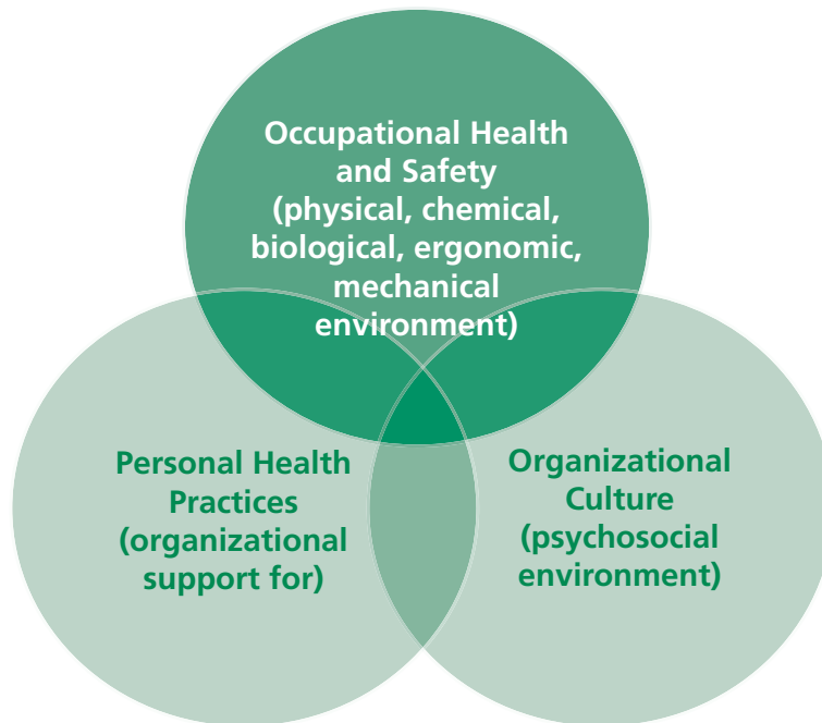
Figure 1. Components of a Healthy Workplace

This model of a healthy workplace is often represented graphically as three overlapping circles, since the three aspects are often interlinked, as in Figure 1: